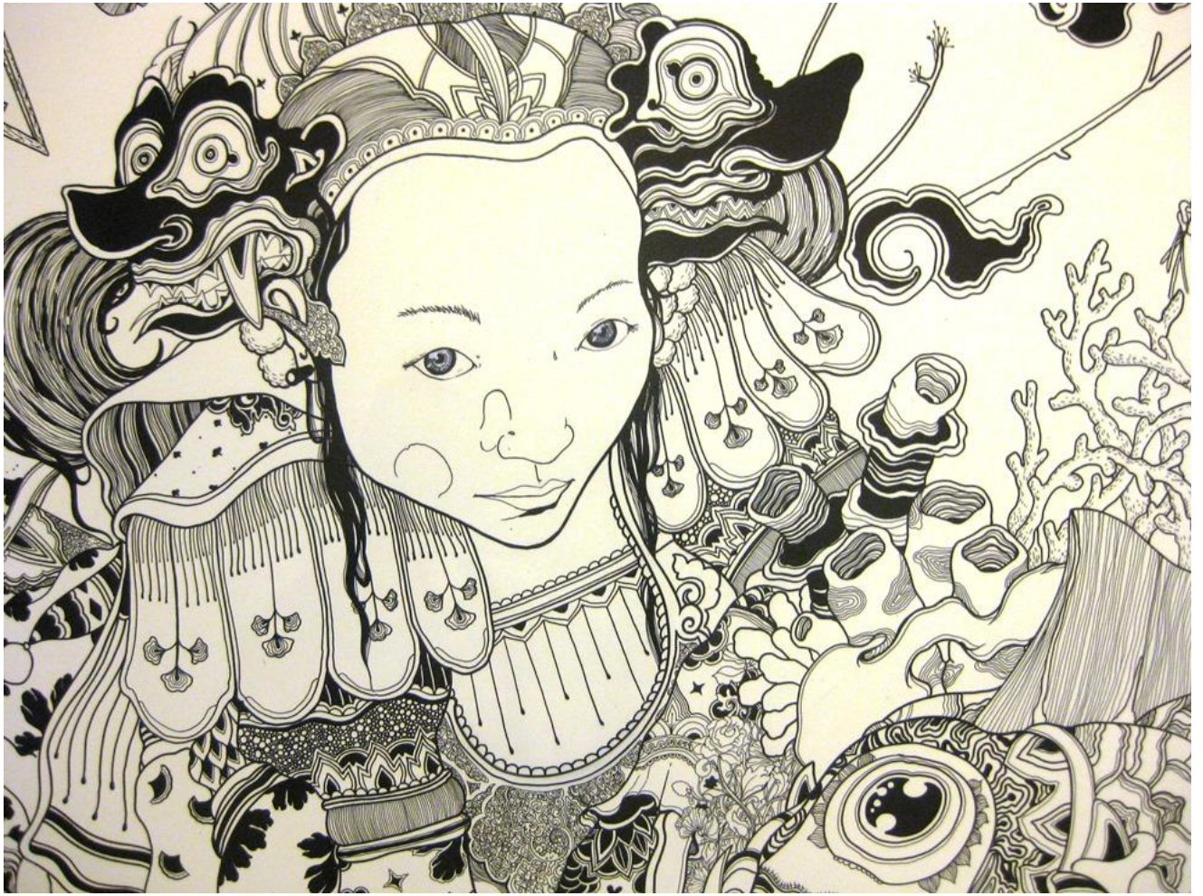
'Mantra Patah Seires' 2015